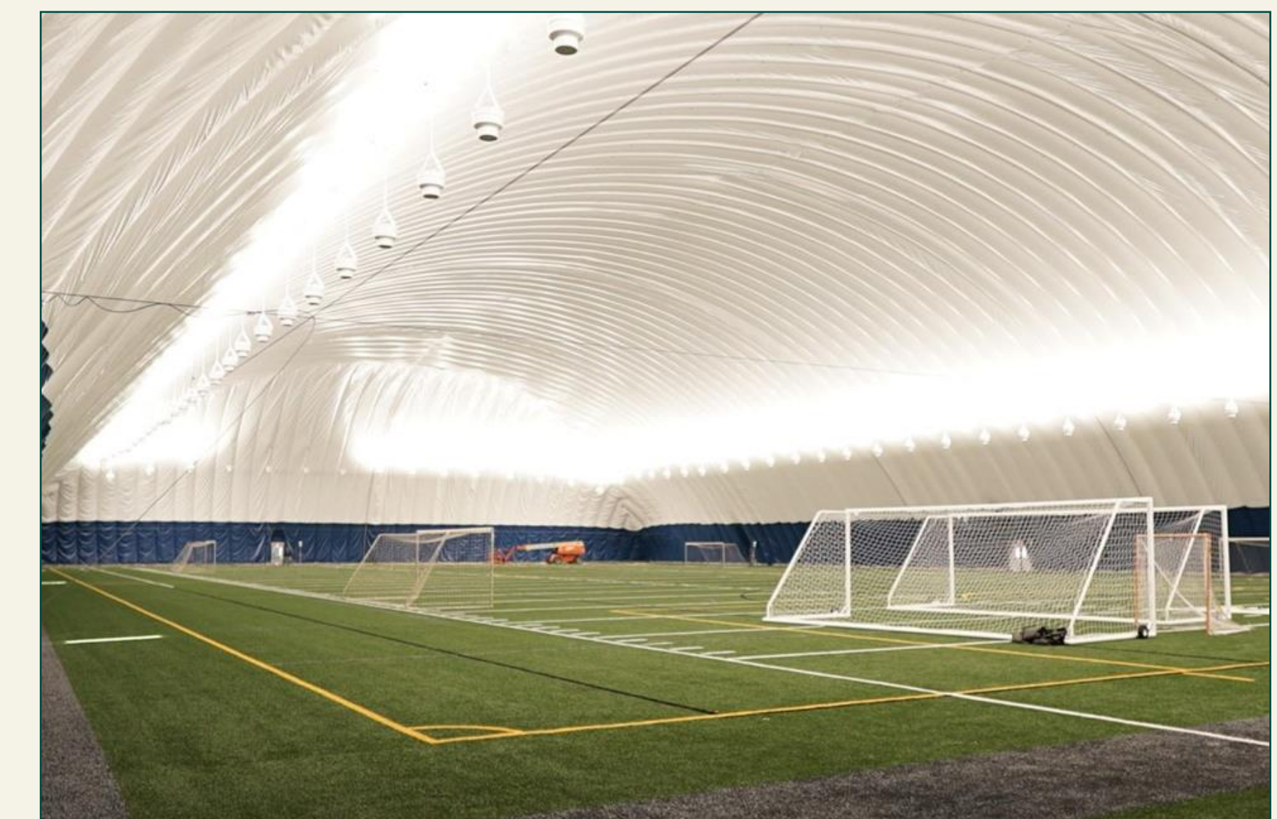
Figure 1 Above. Interior of a fully enclosed indoor turf facility.