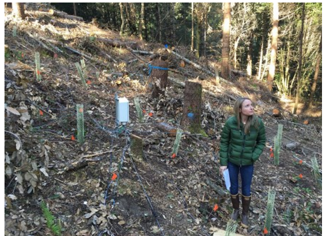
Dr. Lucy Kerhoulas at the variable density study site

The project will wrap up in 2017 with additional monitoring of planted seedling growth and manual weed control to maintain the experiment. The data collected will be analyzed by the researched with the findings published and presented at meetings.