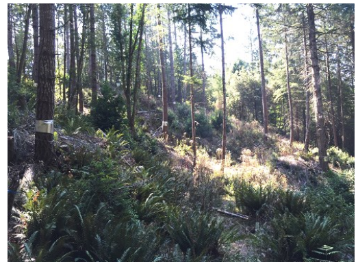
Variable density thinning study site at the Tree Farm