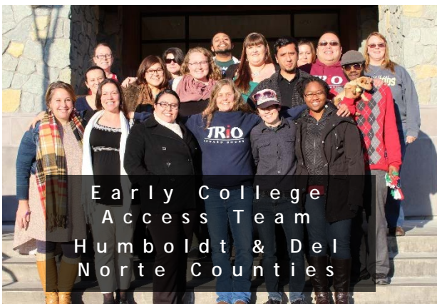
Early College Access Team Humboldt & Del Norte Counties

TRiO Educational Talent Search is a pre-college program aiming to improve the academic strengths and college readiness of students in grades 6-12.