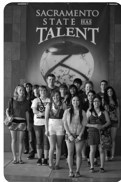
Talent Search students at Sacramento State

"I am grateful to Talent Search for giving me the great opportunity to visit and learn about more colleges. Now, because of Talent Search, I am focusing on my career by getting more information from them. This is the only program that helps us get to know more about colleges. I loved everything about the trip & meeting new people."