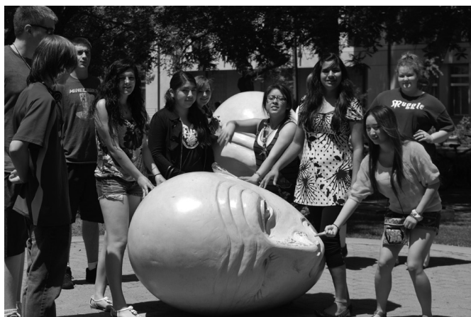
Talent Search at UC Davis

"The trip gave me the opportunity to explore more colleges than I thought I would ever have. I learned so many things like the programs the different colleges offer. It was such a great experience and we had so much fun!"