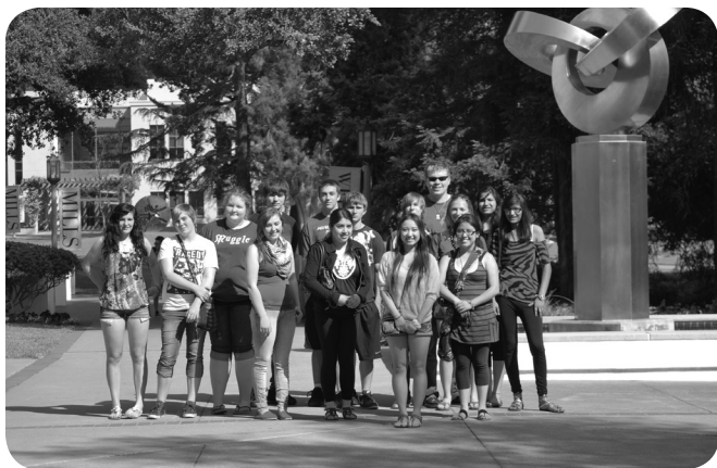
Talent Search students at Mills College

Talent Search TRiO had the privilege of taking 15 students from South Fork, Eureka, Hoopa, and Arcata High Schools on a Sacramento and Bay Area college tour. Here's what some of the students had to say about the trip: