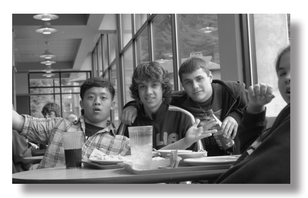
Lunch at the "J"

It is challenging to convince a high school student who is just tired of going to school that college is different, inspiring . . . even fun! The Higher Education Day at Humboldt State University was a better demonstration than any Talent Search Counselor's words could ever describe. On March