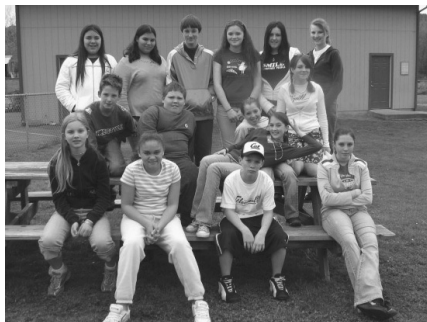
Blue Lake Talent Search Students

Founded in the mid-1950's, Blue Lake Elementary School is one of eleven elementary/middle schools served by the HSU Educational Talent Search program. 177