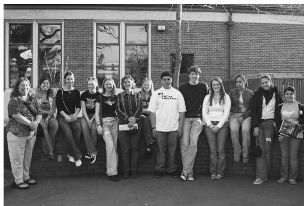
Talent Search counselors and students at the 2006 Northern California Student Leadership Conference

being able to tour the campuses, really gave me good insight into what they had to offer, and additionally, what I could offer them. We were able to attend learning groups where people from the colleges gave us lessons on what we had to have to be eligible to go there, and what kind of extra-curricular activities looked good, stuff like that.