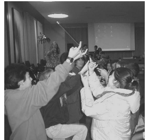
Team building games are fun!

students a chance to come to campus, learn what college has to offer, and see a bit of campus life. For parents, it's a chance to learn how they can better help their student(s) along the path to college. Don't miss out on this Fall's Ice Cream Social!