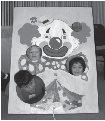
Clowning around at the Ice Cream Social

Family time is good time and that's what the Ice Cream Social is all about. On November 13, 2004, Talent Search students, family, and friends spent the day enjoying time together on the HSU campus, being artistic, painting faces, playing games, taking campus tours, learning