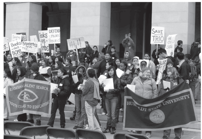
Students march on the capitol in support of TRIO programs.

Students spent the day attending a keynote address, participating in various workshops, and mixing and