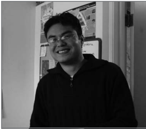
By Isaac To'o

When choosing a college, I was looking for a place that was far away from home as possible. Humboldt fits the description; it was as far as I could go that was in state. I knew racial climate would be different, but at the time I did not care just as long as I was not living at home. But as time went by I was feeling home sick. The small town environment being isolated from everything else and the lack of diversity on campus was taking its toll on me. I wanted to transfer to another school, a place that was closer to home, and a place where I didn't feel like the only minority on campus.