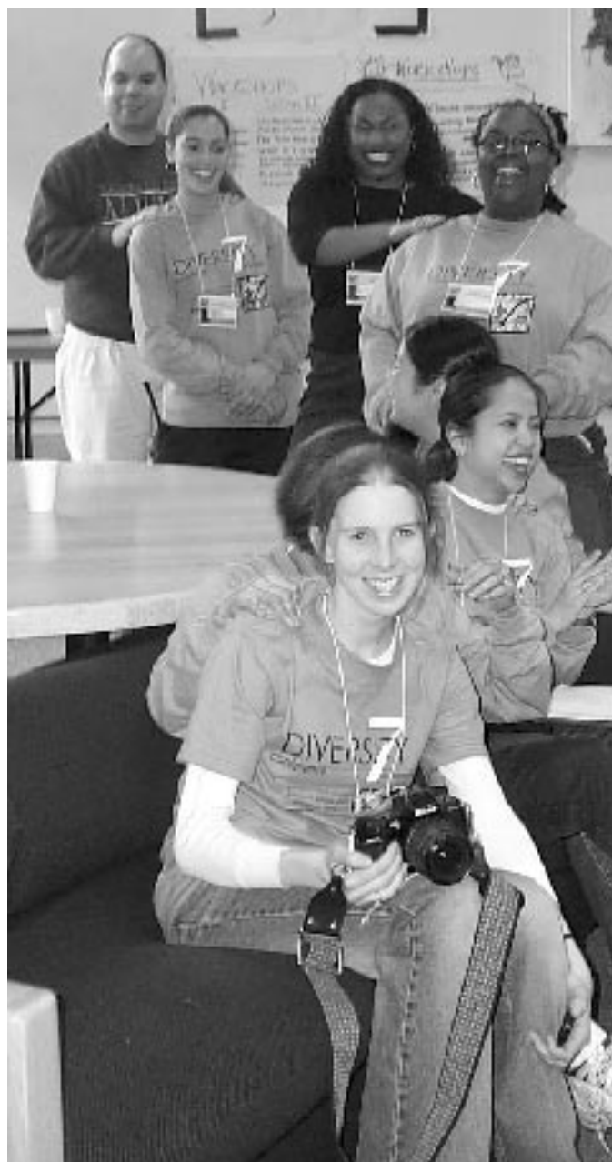
(top) The Diversity Conference staff conducting a massage train.