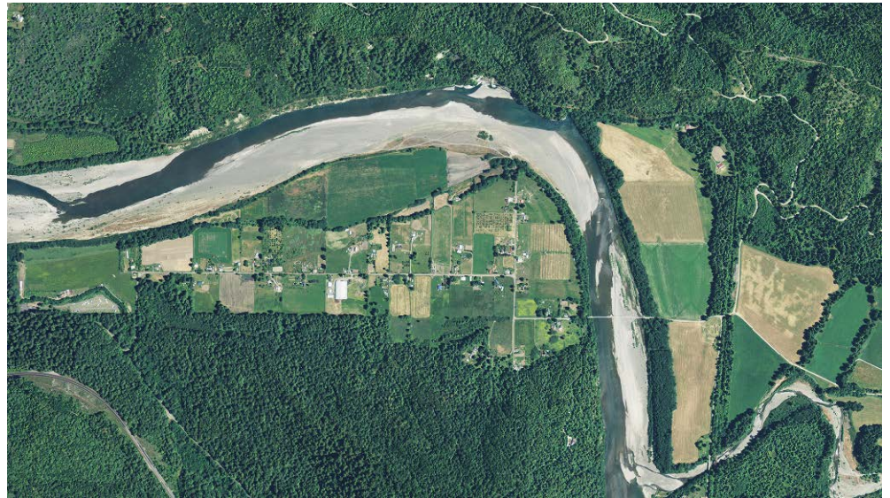
» Streams like California's Eel River, above, flowing through Humboldt Redwoods State Park, would benefit from a coordinated, consistent approach for setting environmental flow targets.

Managers typically start flow target analyses from scratch, and often must synthesize multiple data sets, multiple sources of information about ecological functioning, and multiple technical approaches. The California Environmental Flows Framework (CEFF), which is under development, will help managers improve the speed, consistency, standardization, and technical rigor of these analyses.