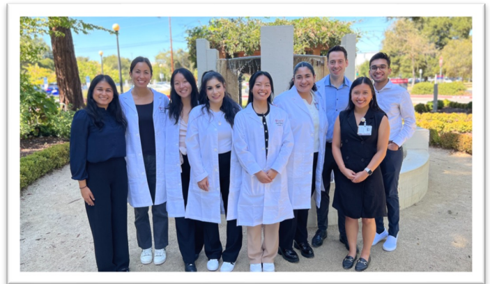
Class of 2024-25