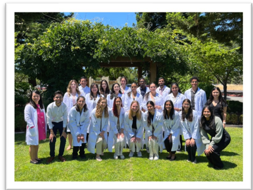
Class of 2024-25